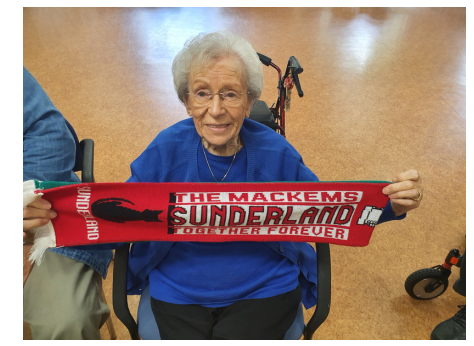
Sporting Memories participant

The Pink Pack, which is distributed weekly, recently passed its 150th milestone. If you would like to gain a copy of the Sporting Pink Pack, please complete our registration form on the SportsUnited website.